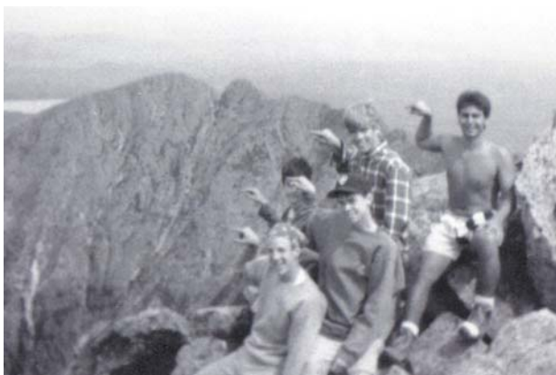
Campers from the 1992 trip pointing out the Knife Edge.