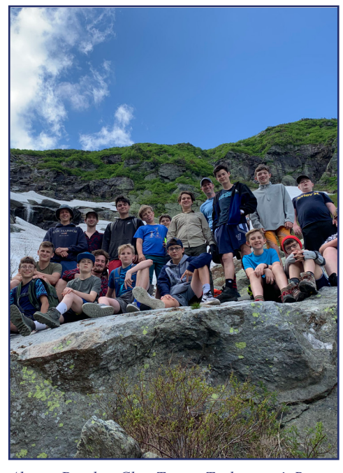
Above: Panther Clan Trip in Tuckerman's Ravine Below: Rock Climbing at the Tohko Dome